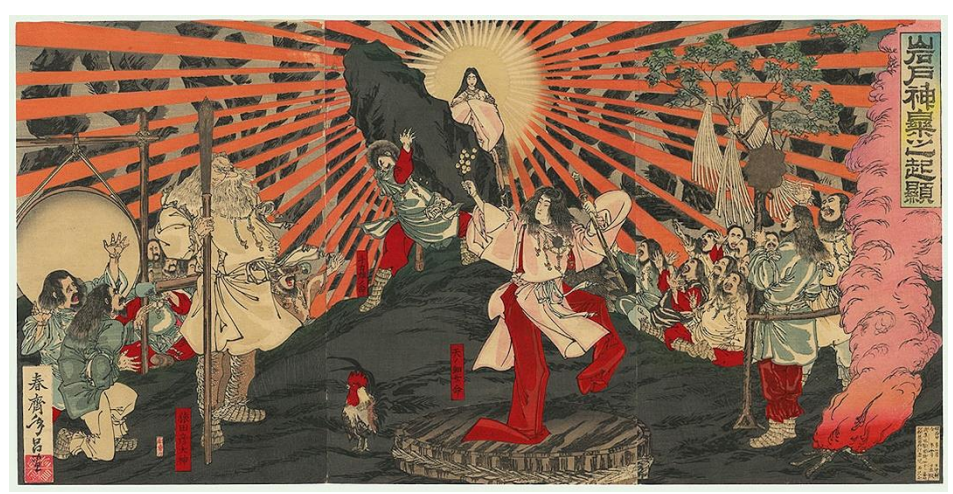
Fig. 1: "Origin of Music and Dance at the Rock Door." Woodblock print, signed Shunsai Toshimasa. 19th century.