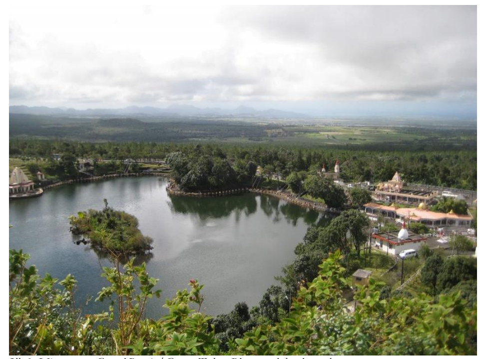
Ill. 2: View across Grand Bassin/Ganga Talao.