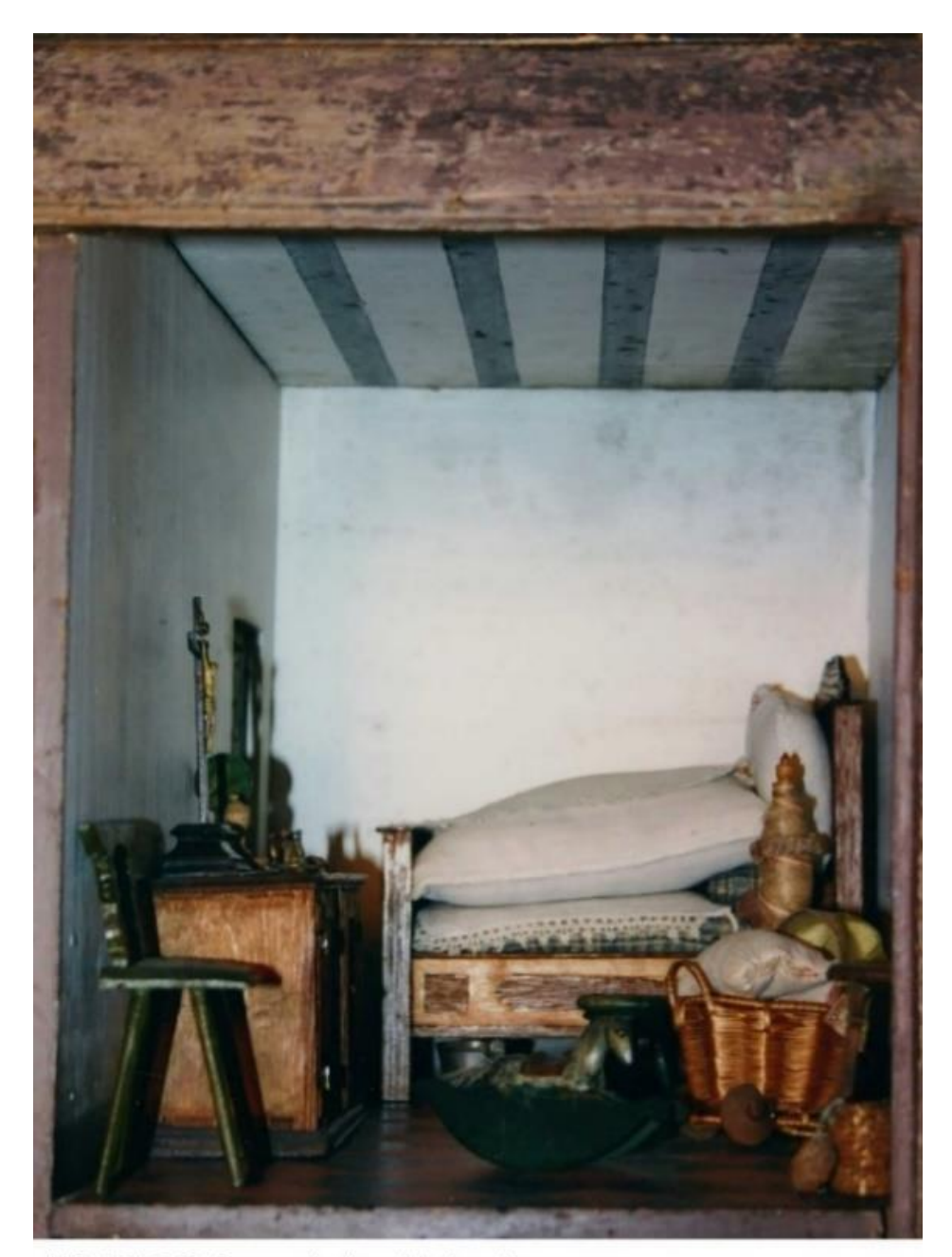
HG 4063