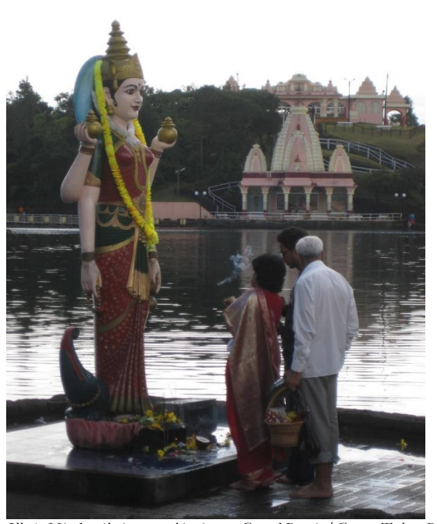
Ill. 1: Hindu pilgrims worshipping at Grand Bassin/Ganga Talao.

For Hindus, Grand Bassin is also known as Ganga Talao (Ganges pond). For a long time, legends have circulated about a supposed subterranean connection beneath the Indian Ocean between this Mauritian lake and the sacred river Ganges in India. In a ceremony in 1972, the lake was officially consecrated as Ganga Talao with the aid of a vessel of holy Ganges water (ganga jal) flown in with the assistance of the Mauritian and Indian governments. Ever since, Mauritian and globally operating Hindu organizations with major support from the Mauritian government have built up the site into a replica of an Indian Hindu sacred geography. This has involved the building and extending of temples, with the name of the oldest temple referencing the most sacred temple of the famous Hindu pilgrimage city of Banaras on the Ganges in India (Kashi Viswanath Mandir), the construction of ghat and in recent years even with the building of a giant 33 meter-high statue of Shiva, the main deity of Ganga Talao, overlooking the entire site, along with another giant statue of identical height of the goddess Durga. Caste rivalry among Mauritian Hindus of north Indian descent has been another driving force in the building of temples and the extension of the sacred site.