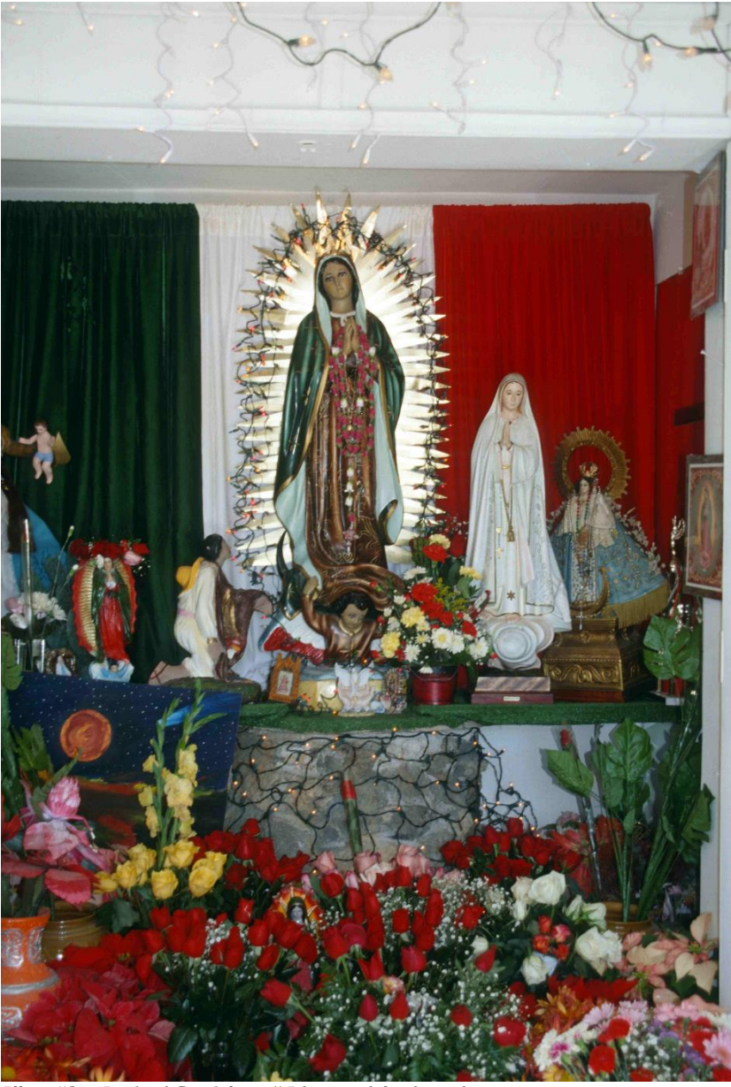
Ill. 1: "Our Lady of Guadaloupe."