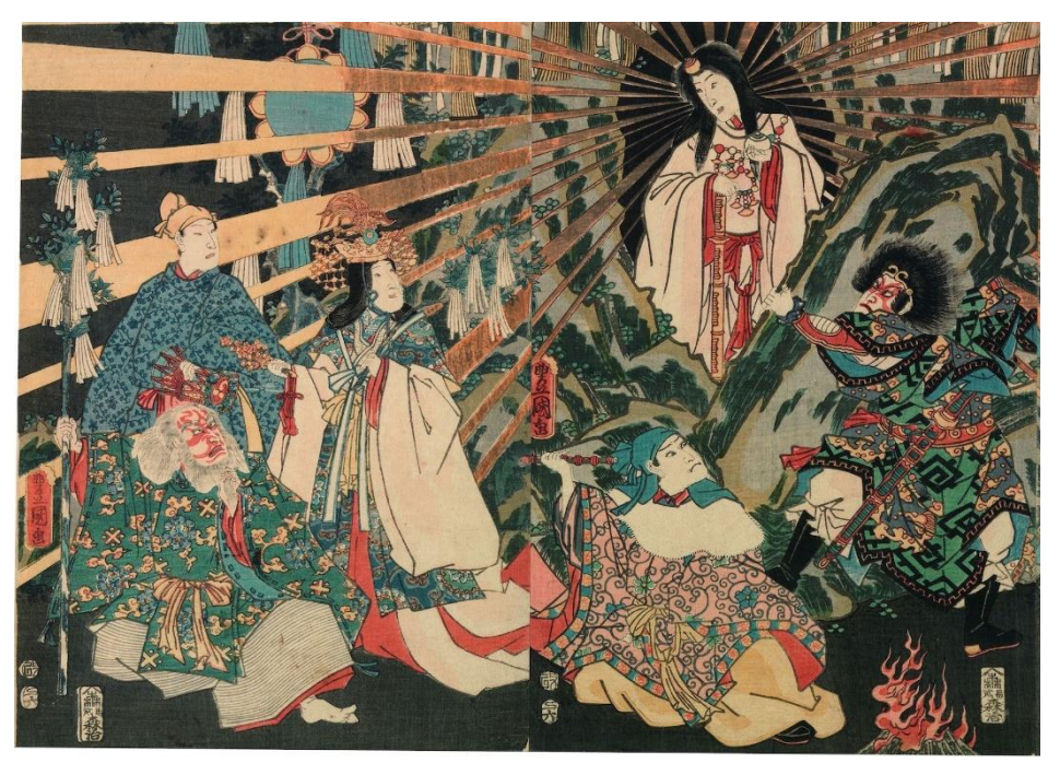
Fig. 2: Amaterasu Leaving the Cave (left half), signed Toyokuni III. Edo period (1603 to 1868).