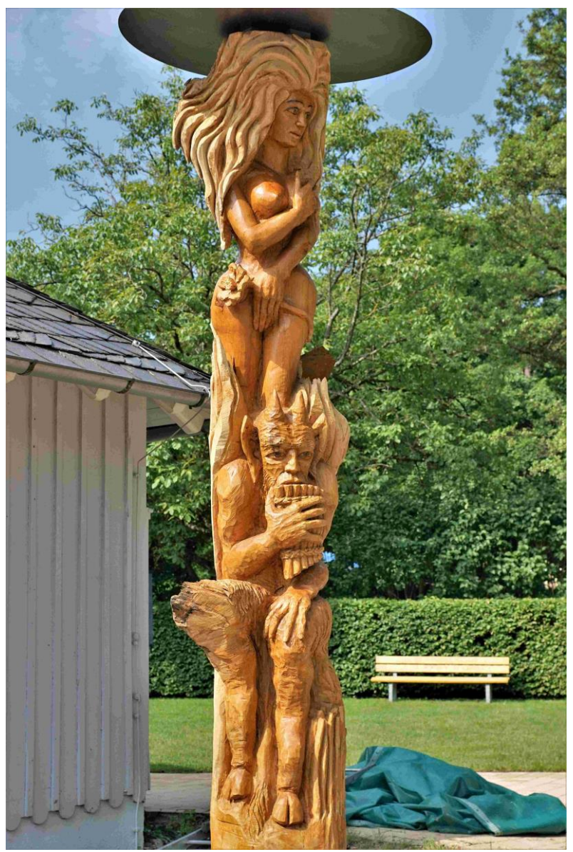
Abb. 1: Statue von Loretta im Freiburger Lorettobad, photographiert vom Künstler. Abdruck mit freundlicher Genehmigung.

reglementiert? Warum fand keine weitere kritische Diskussion statt, die sich auch mit den berechtigten Bedürfnissen muslimischer Frauen befasste?